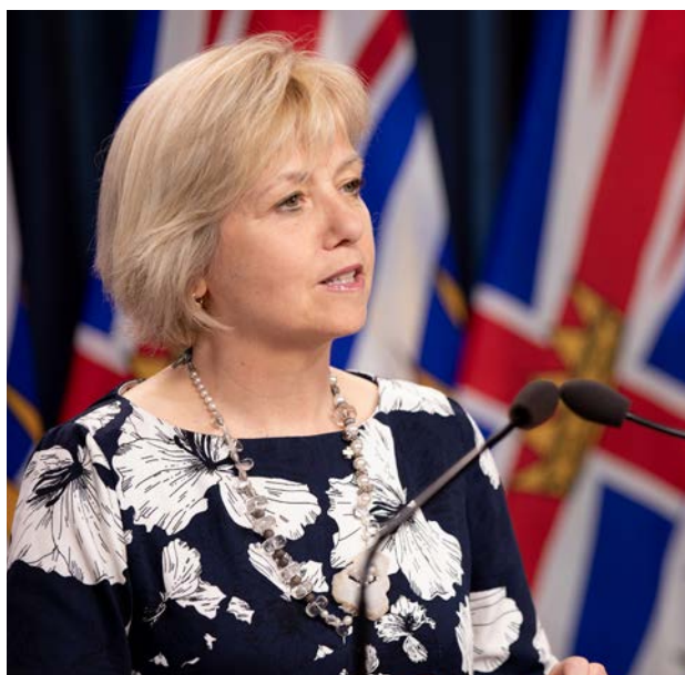
Dr. Bonnie Henry

“Vaccines are the primary tool in our toolbox for managing COVID-19 in the long term and people have stepped up in a big way to get vaccinated, which has made a huge difference in creating high levels of immunity and protection across the province,” said Dr. Bonnie Henry, B.C.’s provincial health officer. “As we move through this transition period and lift restrictions, we encour-