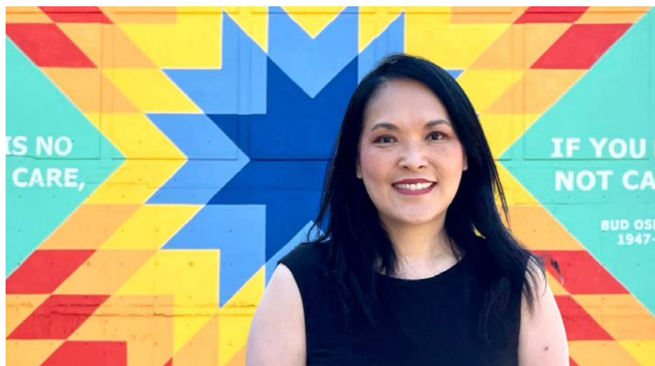
Jenny Kwan, MP, Vancouver East

I want to take a moment to thank the many seniors and advocates, like the 411 Seniors Society and the Kettle Society, who have been in touch with my office to speak up about the shameful decision that the